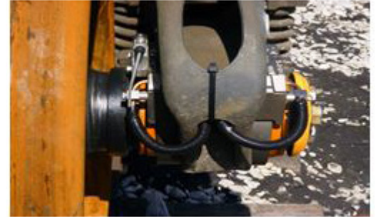
Wilcoxon model 787A mounted on the bearing adaptor of 100 ton coal car

Where considerable time and attention have been given to developing a system for bogies and track monitoring, not enough effort has been devoted to monitoring the locomotive engine. If one looks at the components in a locomotive engine, it is easy to recognize equipment already proven to benefit from vibration monitoring.