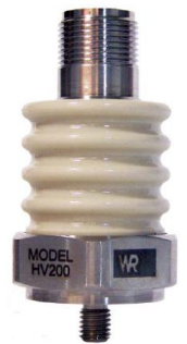
Figure 2: HV accelerometer

Motors and generators are often located next to or near instrumentation cable trays. EMI and Radio Interference (RFI) can interfere with signal transmission causing data errors. These cable runs provide a path with a means to store charge through the wire capacitance. Some monitoring systems may use up to 1,000 feet of wire between the sensor and data access point. To reduce interference, shielded cables and connectors should be used with high EMI resistance sensors to ensure reliability of data.