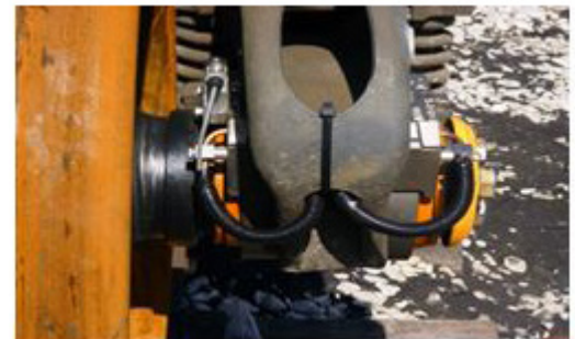
Wilcoxon model 787A mounted on the bearing adaptor of 100 ton coal car

Where considerable time and attention have been given to developing a system for bogies and track monitoring, not enough effort has been devoted to monitoring the locomotive engine. If one looks at the components in a locomotive engine, it is easy to recognize equipment already proven to benefit from vibration monitoring.