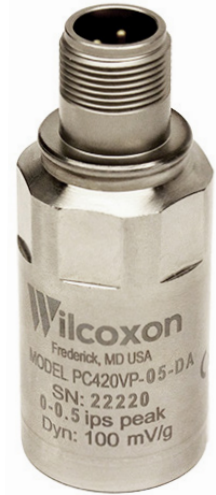
Table 1: PC420Vx-yy-Dz dual output model selection guide

Wilcoxon's 4-20 mA vibration sensors integrate easily with an existing PLC, DCS or SCADA system. The PC420V-Dz series dual output sensors provide 24/7 monitoring of overall machine vibration for continuous trending, alerting users to changing machine conditions and helping to guide maintenance in prioritizing the need for service. The choice of true RMS or peak output allows you to choose the sensor that best fits your industrial requirements. The 4-20 mA output of the PC420A series is proportional to acceleration vibration. The dynamic output signal is derived from an internal buffered amplifier and requires that the 4-20 mA loop be powered.