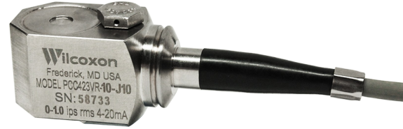
Table 1: PCC423xx-yy-C model selection guide